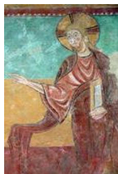
detail from the Temptation