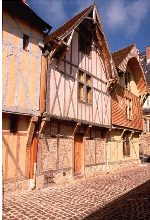
les maisons à colombages

In the 10 th century Troyes passed into the hands of the Comtes des Champagne. This was a period that considerably enriched the town. One of the counts, Henri I, built 13 churches, 13 hospitals (including l’Hôtel-Dieu de Troyes) and benefited the town in many other ways. For this he acquired the title “Henri Libéral”.