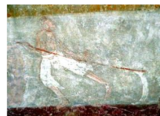
The labours of the month: June

The main components for each group are listed below.