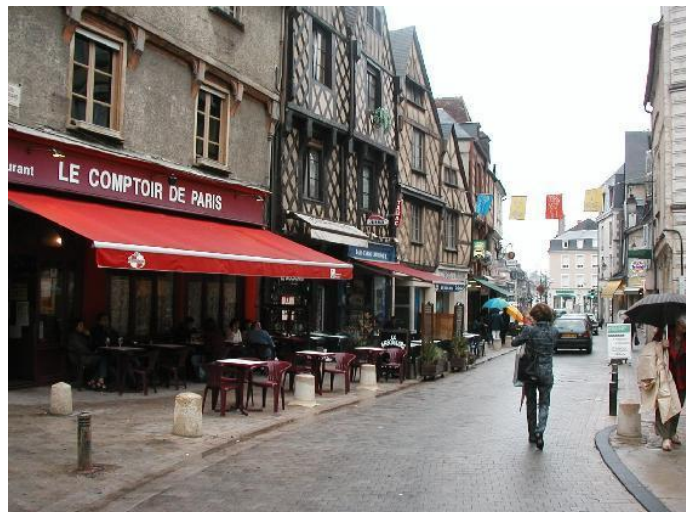
Bourges: the Old Town

During the Hundred Years' War (1337 and 1453), when other parts of France were in English hands, Bourges was the capital of Charles VII of France. Charles published the Pragmatic Sanction of Bourges in 1438, which limited papal authority over the French church. In 1463, Louis XI founded the University of Bourges. The university's influence spread beyond Berry, attracting such notables as John Calvin who later published his ideas on the reform of the Church. He received considerable support in Bourges, and the rest of Berry. During the French Revolution, the university was abolished. In 1487, over two-thirds of the town was destroyed by fire and Berry's influence and wealth declined. From the 17 th century Bourges declined further, while other towns on the River Loire expanded economically.